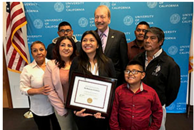
'First-gen' student pays it forward